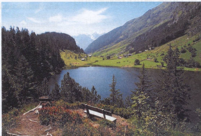
Golzerensee and the beautiful Maderanertal

This east-west running side valley of the Reuss valley is another quite famous mineral location in Switzerland. The name of the Maderaner valley goes back to a noble family who mined in the 16th and 17th centuries the iron ores at the Windgällen locality. After the Madran family diminished in 1631, the mining came to an end. In the 19th century, some wanted to start it again but the people of Silenen prohibited the use of wood out of the forest, a quite remarkable move at that time.