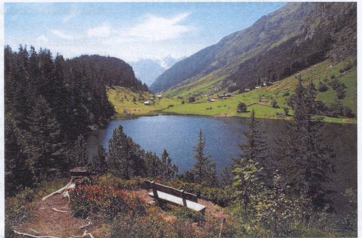
Golzerensee and the beautiful Maderanertal

This east-west running side valley of the Reuss valley is another quite famous mineral location in Switzerland. The name of the Maderaner valley goes back to a noble family who mined in the 16th and 17th centuries the iron ores at the Windgällen locality. After the Madran family diminished in 1631, the mining came to an end. In the 19th century, some wanted to start it again but the people of Silenen prohibited the use of wood out of the forest, a quite remarkable move at that time.