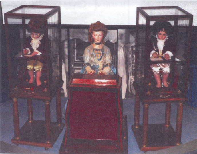
The draughtsman, the writer and the musician by Pierre Jaquet-Droz

The star attractions of this museum are the three mechanical figurines built to the most exacting technical standards by a Neuchâtelois watchmaker in the 1770s and still in perfect working order today. The three - the Draughtsman, the Writer and the Musician - are displayed static behind glass, with a fascinating accompanying slide-show in English by way of explanation, but if you can you should really time your visit for the first Sunday of the month, when they are brought to life for a demonstration. The Draughtsman is a child sitting at a mahogany desk and holding a piece of paper with his left hand; his right hand, holding a pencil, performs extraordinarily complex motions to produce intricate little