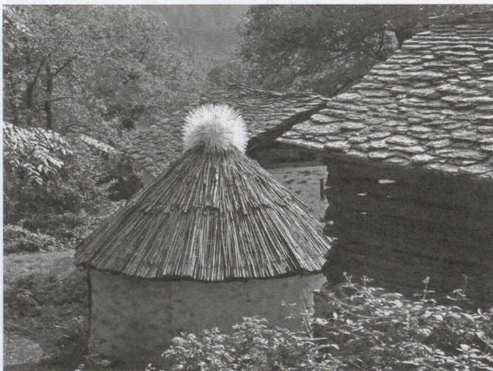
Soglio, Ticino with chestnut forest in the background

Farmers and landowners must be encouraged to continue grazing their livestock on mountain pastures.