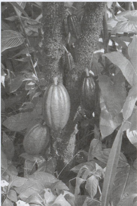
The cocoa tree

The Swiss non-governmental organisation Berne Declaration has launched a campaign to encourage the country's chocolate producers to do more to ensure the cocoa they buy comes from ethical sources.