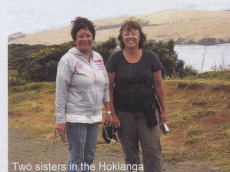
Two sisters in the Hokianga