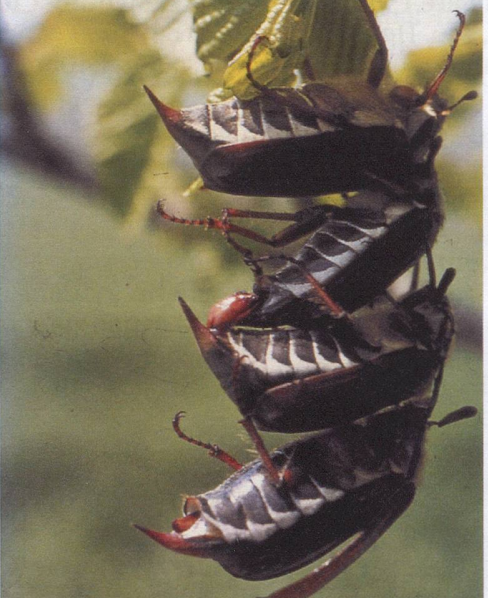
Maikäfer - Cockchafer

I'd have my own Maikäfer memories, but as they are rather unsavoury I better keep them to myself.