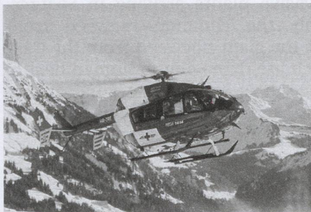
One of Rega's fleet of helicopters

The air rescue service Rega is preparing to face the busy winter sports season. More than a quarter of Switzerland's population are members of Rega. Rega's helicopters can reach the scene of an accident anywhere in the country in 15 minutes.