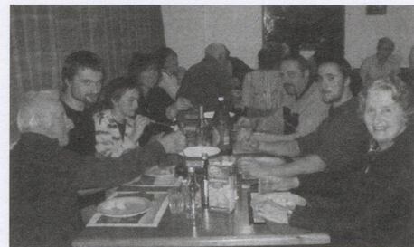
The main medal winners...