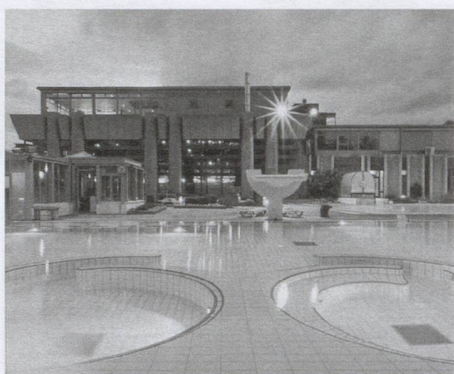
Thermal Centre at Yverdon-les-Bains

The springs were probably known and used even before the Roman era, at the time of the Helvetii, when the springs were a sacred place. Documents from the Middle Ages prove the existence of a spa centre as early as 1429, and mention several buildings.