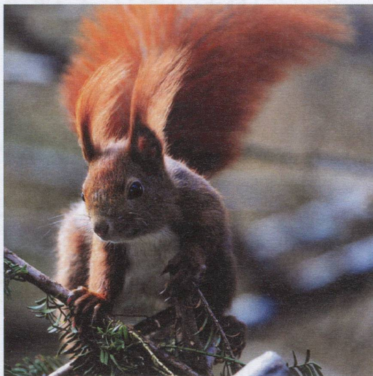
The Eurasian red squirrel – Eichhörnchen