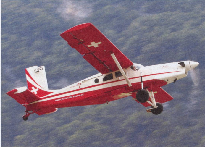
PC-6 Porter Pilatus aircraft

The PC-6 Porter was Pilatus's first aircraft to achieve widespread international success.