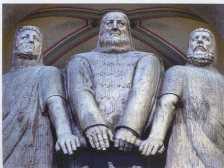
The original Confederates