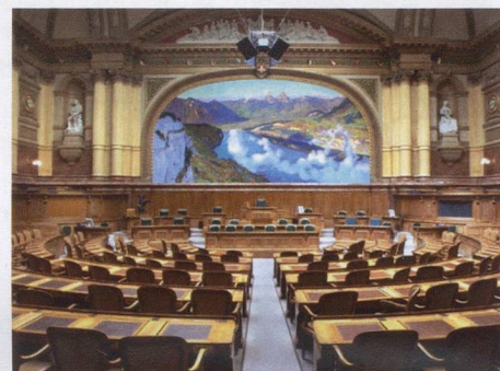
National Council Chamber