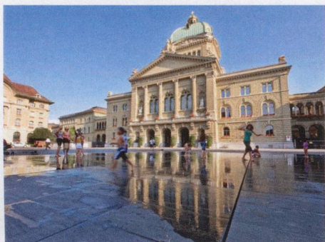
Bundeshaus with Bundesplatz

« Curia Confederationis Helveticae », the building that houses the Swiss Parliament (Bundeshaus), was erected between 1894 and 1902. It was designed by Hans Wilhelm Auer, an architect from St. Gallen. Its construction involved 173 Swiss firms, while 33 Swiss artists were commissioned to decorate it.