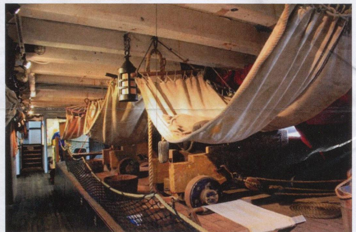
Sleeping quarters directly over the cannons!