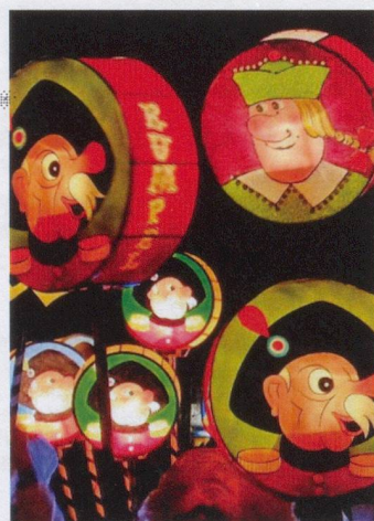
Lanterns at the Morgestraich