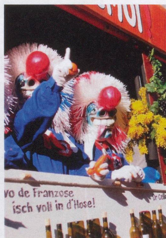
Waggis having some fun