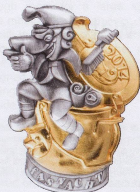
Fasnacht Plaque (Badge) 2014

For further information about the Basler Fasnacht, go to www.fasnacht.ch . Fasnacht 2014 commences on 10 March 2014.