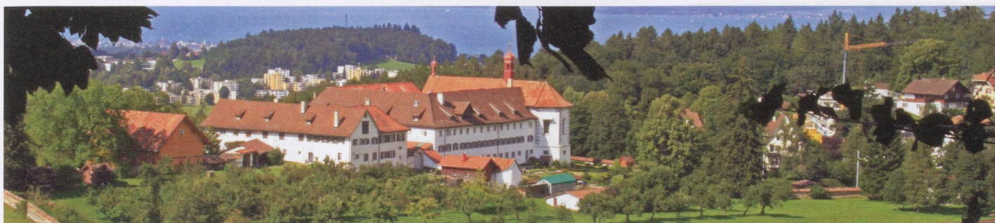
The Convent of Notkersegg, overlooking St. Gallen and Lake Constance in the North, forms part of a picturesque walking trail by St. Gallen