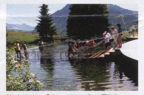
Kneippanlage Schwandalpweiher (Flühli)

significance would not be possible. However, the eight municipalities of the Entlebuch have come together in a remarkable cooperative enterprise. They have created a democratically elected council, a board and an executive management team - not only focusing on the protection of the local biodiversity and cultural heritage, but also on realising economic and social opportunities in keeping with the goals of the biosphere. Industry, farmers, schools and volunteers all play a key role in this enterprise. The growing number of Entlebuch products that meet Biosphere goals are proud testament to the determination of the region's people. All up, the Entlebuch region has invented a unique concept around developing its Biosphere Reserve which is recognised as an international model.