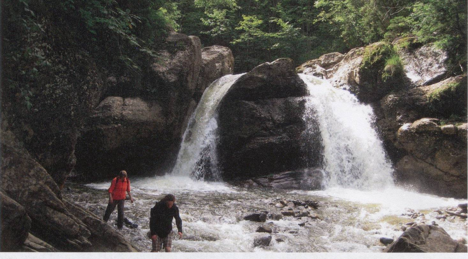
Hiking across the river landscape of the Grosse Entlen River

The diversity of the landscapes in turn allows a great diversity of the fauna and flora, including a wide number of endangered species. These include for example the golden eagle and the wood grouse (Auerhuhn), as well as the Sonnentau (a meat eating plant). UNESCO's Biosphere Reserves aim to address some of humanity's key questions of today: How can we integrate the protection of natural biodiversity and local cultural traditions with sound economic and social development?