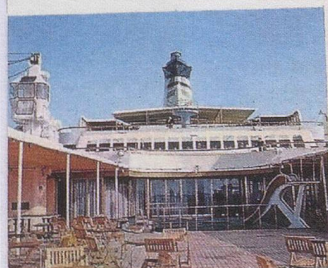
Piscina - Swimming Pool