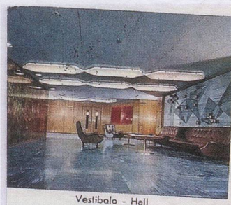
Vestibolo - Hall