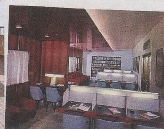
Sala Lettura - Writing Room