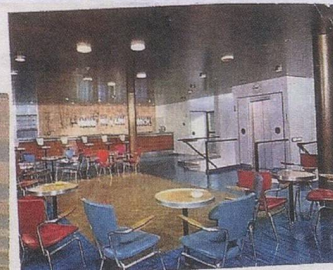
Veranda - Verandah