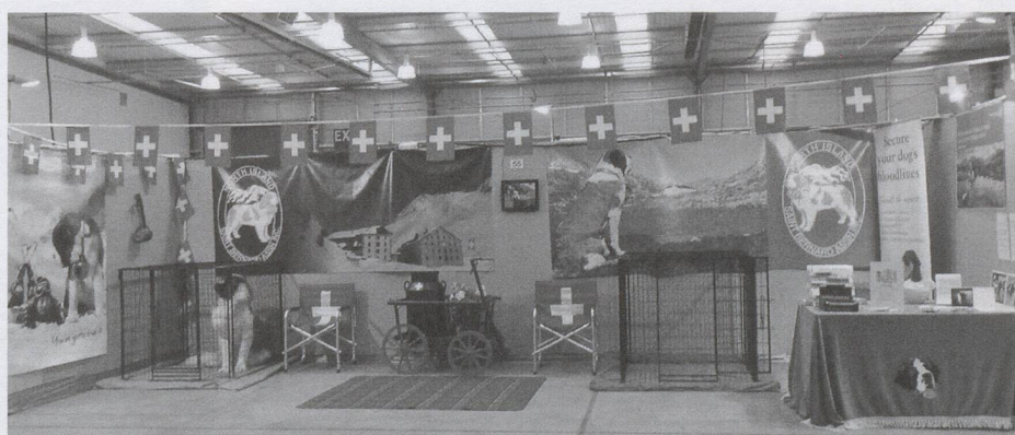
NISBA Inc stall at 2013 Pet Expo - before the crowds.