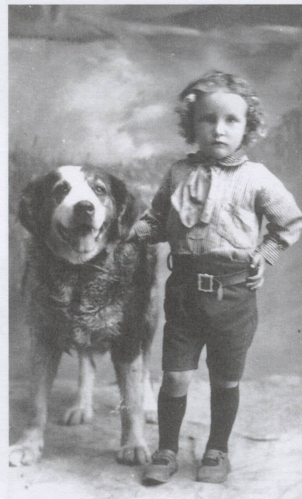
1910 real photograph of a boy with his St Bernard, 'Floss', in New Zealand. Indicates poor head type.