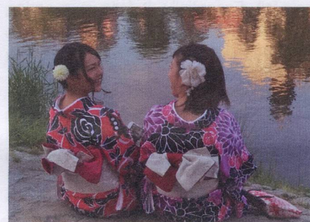
River with Kimono girls, Kyoto