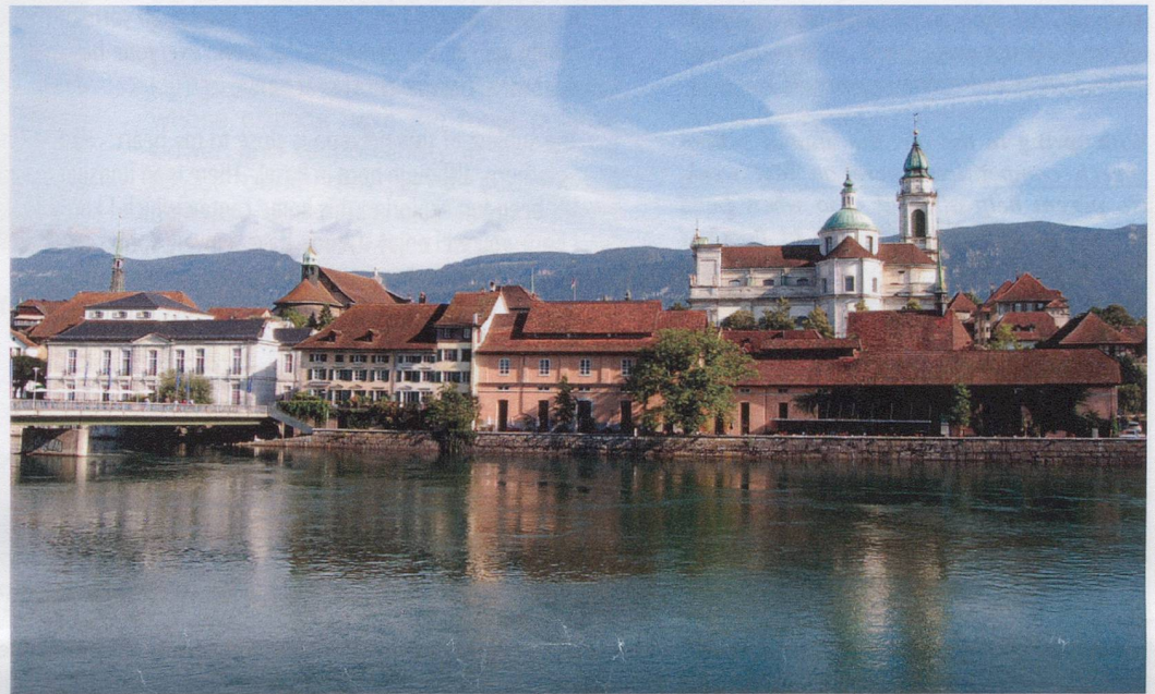
Solothurn viewed north from across the Aare River towards the Jura mountains, with the water front and Cathedral of St Ursus and Victor in the foreground.

Solothurn is a sleepy little provincial town on the Aare River, overshadowed by the Weissenstein Massif of the Jura Mountains. But don't underestimate this little backwater which packs a long and tumultuous history.