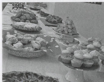
Some of the 17 entries