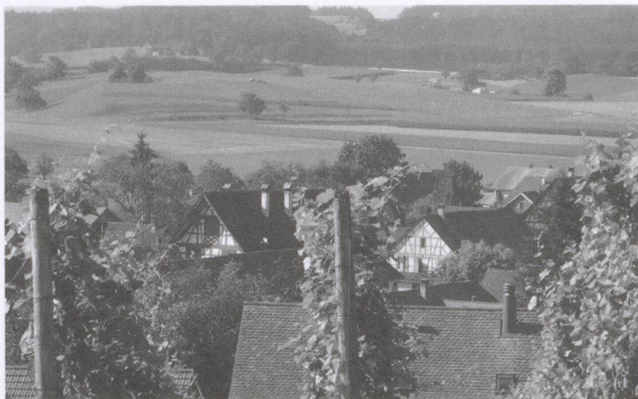
Zuercher Weinland Village Stammheim

The following is an interview by Trudi Fill-Weidmann with the co-owners of BEGE, a fusion of two Swiss farms. This enterprise is situated west of the Thurgau border, near the shores of the river Thur, in Niederwil, near Andelfingen, in a region named the Zuercher Weinland. Drops like Klosterberger, Schiiterberger, Ossinger and Stammheimer are wines that are grown in the area, mainly from the red Blauburgund or the white Riesling Sylvaner grape. The land is post glacial, flat, easy to cultivate and slightly sandy, which is beneficial to root crops like potatoes, carrot, beets and asparagus. The geological make-up of the area has been deemed well suited for the final storage of medium and high radioactive waste, according to scientific research carried out by NAGRA. Deep down. One day. Just by the way.