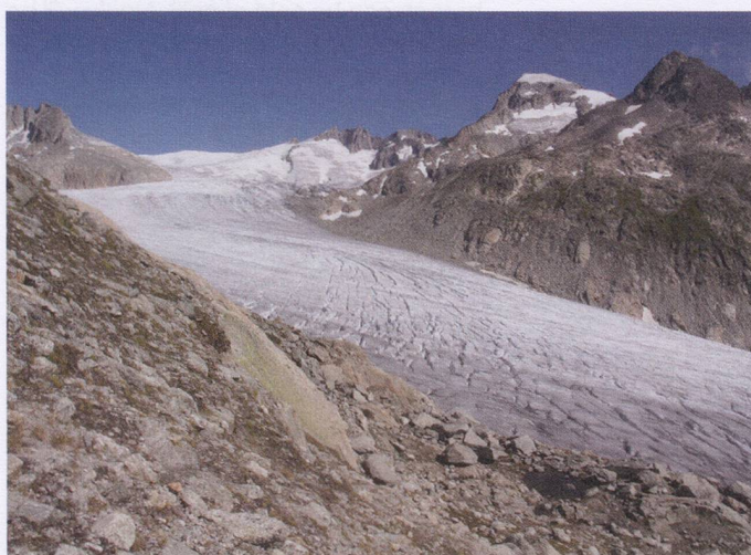
Rhone River arises from the Rhone Glacier