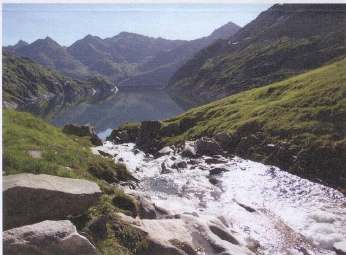
Reuss spring flows into Lucendro Dam