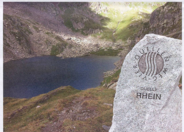
Tomasee – source of the Rhine