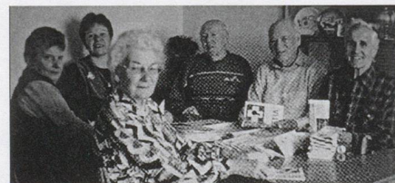
The Helvetia packing team from 1997-2002