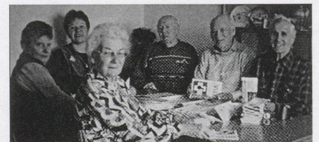
The Helvetia packing team from 1997-2002