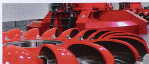
A part of the Oberhasli underground pump station

However, sometimes the intentions behind creating these underground hollows have lost their worth over time. Hundreds of Swiss Army sites have eventually become redundant for various reasons: because of their age, weakness or incorrect positions; or simply because they were no longer needed. Some well-intentioned tunnel builds have even later been written off – a 5km stretch diverging off the main Furka Tunnel line was never used and has since been blocked off! As well, the 2km SBB Lenten Tunnel under Zürich was no longer needed around 1989 and so was unceremoniously filled in. An old Commando bunker in Canton Aargau was unexpectedly discovered