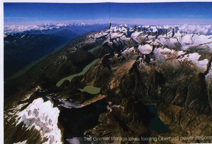
The Grimsel storage lakes feeding Oberhasli power stations

The uninitiated would certainly become hopelessly lost within this alpine labyrinth, with many parts only accessible on