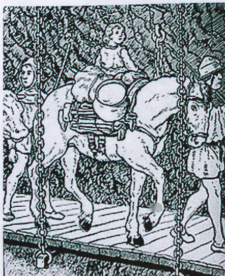
A depiction of the Twaerrenbruecke, the treacherous cliff-side board-track used to cross the gorge