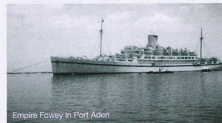
Empire Fowey in Port Aden

Coming back after two week's leave, my request to move from the bakery to the galley was finally granted, and I transferred to the 'HMS Empire Fowey', stationed at Southampton. The Suez Canal had just reopened and we were once again able to use this short-cut. But at this point in time, it was still very much a war zone, and for quite some