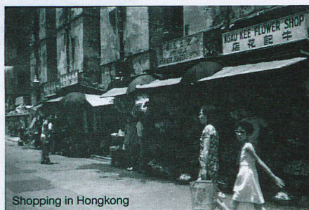
Shopping in Hongkong

Article compiled by Beatrice Leuenberger