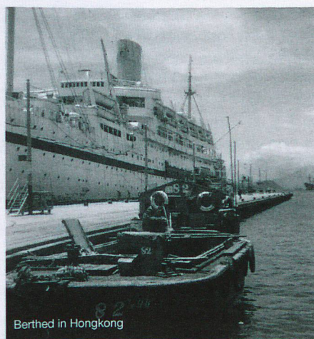
Berthed in Hongkong