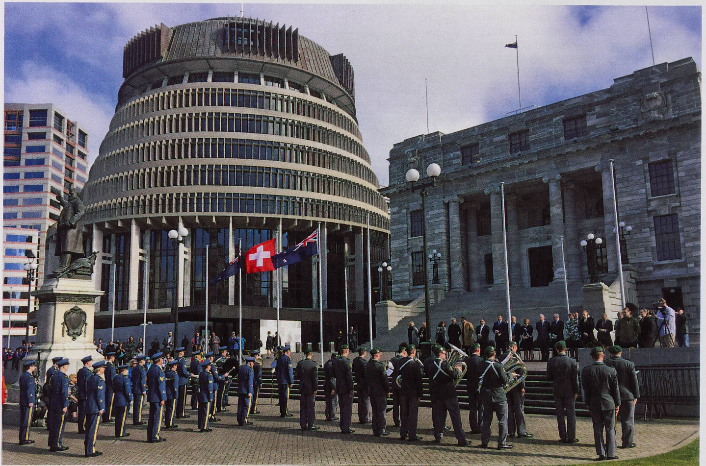
Joint performance with the New Zealand Air Force Band in front of parliament