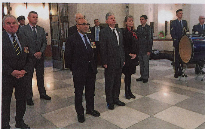
Last Post Ceremony at the National War Memorial together with the Minister of Defence, the Hon Ron Mark