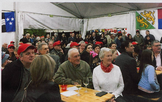
Big crowd at the residence on the 1st of August