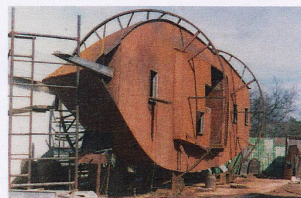
Christabelle in progress