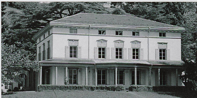
Charlie Chaplin | Charlie and Oona Chaplin's unique family home (turned museum), Manoir du Ban. They raised their 8 children here.

Throughout his career he released approximately 81 films with about 35 of them highlighted at Chaplin's World. Entire Hollywood scenes have been reproduced