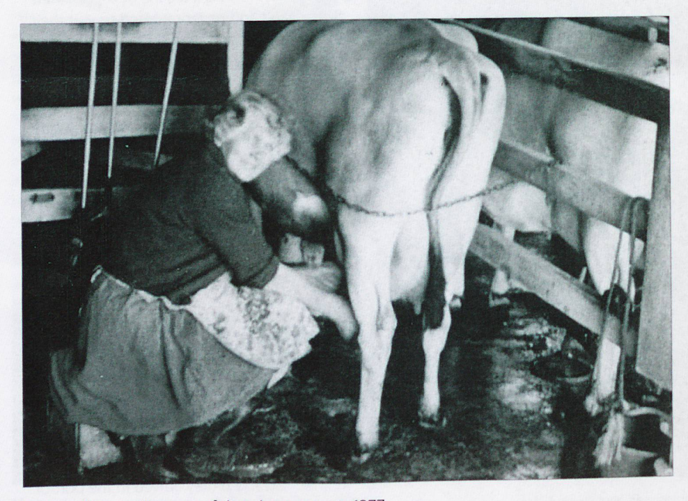
Kurigers | Rosa milking one of their Jersey cows in 1977.

During the Depression there was little money, but the children were always loved, clothed, and fed well. Crops were planted in a portion of the field, with mixtures of vegetables and of course potatoes! They felt incredibly lucky to be on a farm as they had milk, home kill meats (beef, sheep, and pigs), hens supplied eggs and chicken for soups and they had few fruit trees too, Swaggers called in many times, some just for a feed