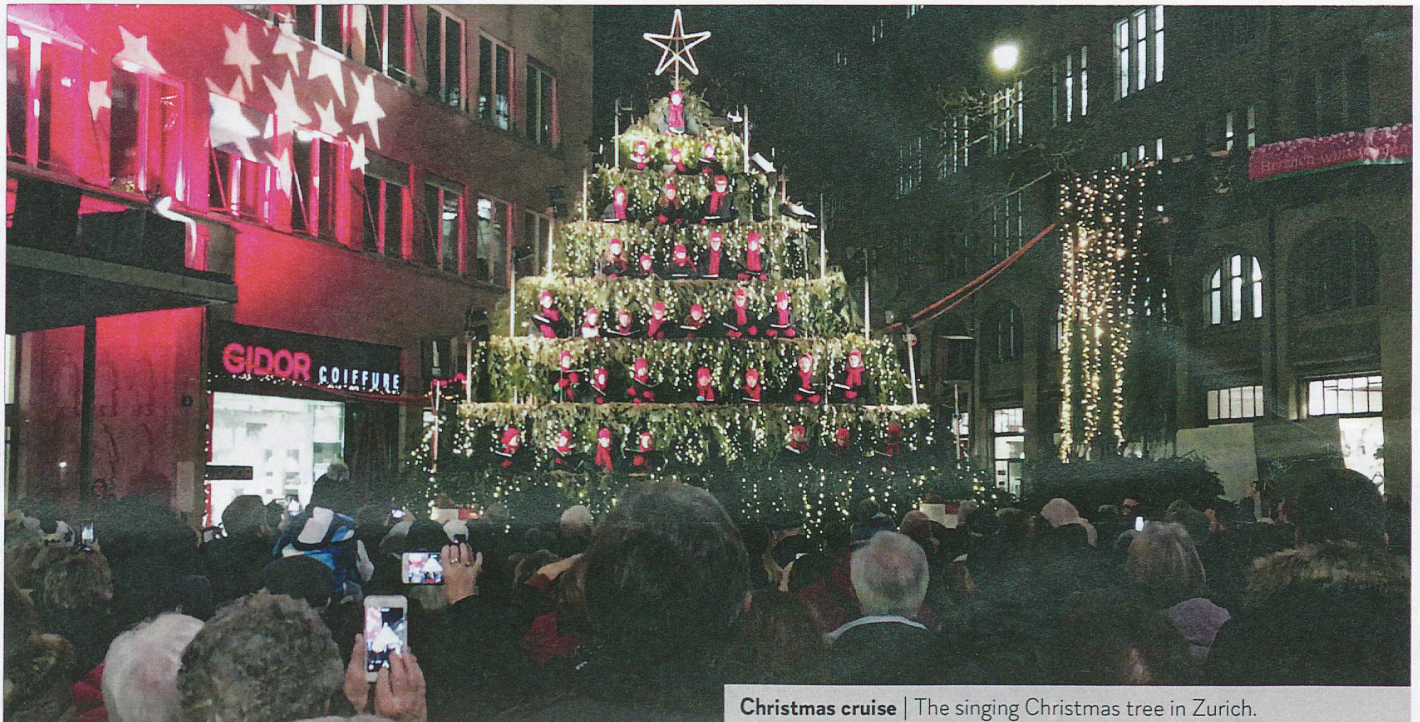
Christmas cruise | The singing Christmas tree in Zurich.

filled to bursting with Christmas cookies, decorations and delights. There are several markets here, many of them themed.