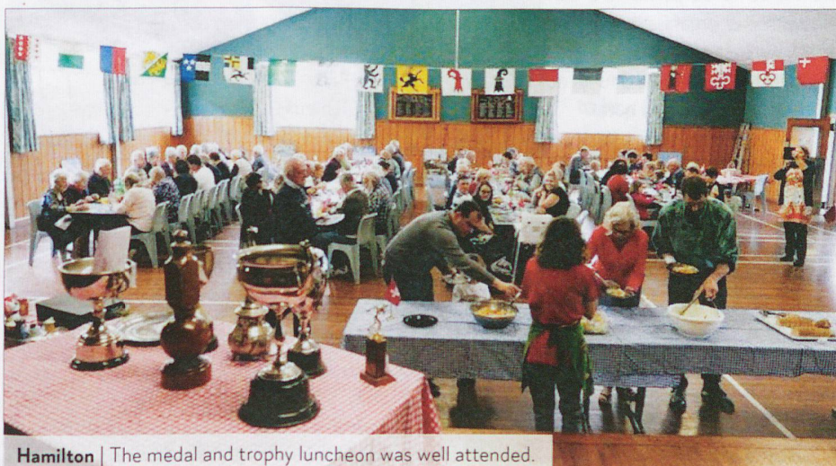
Hamilton | The medal and trophy luncheon was well attended.