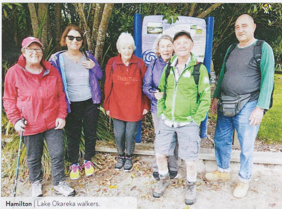
Hamilton | Lake Okareka walkers.