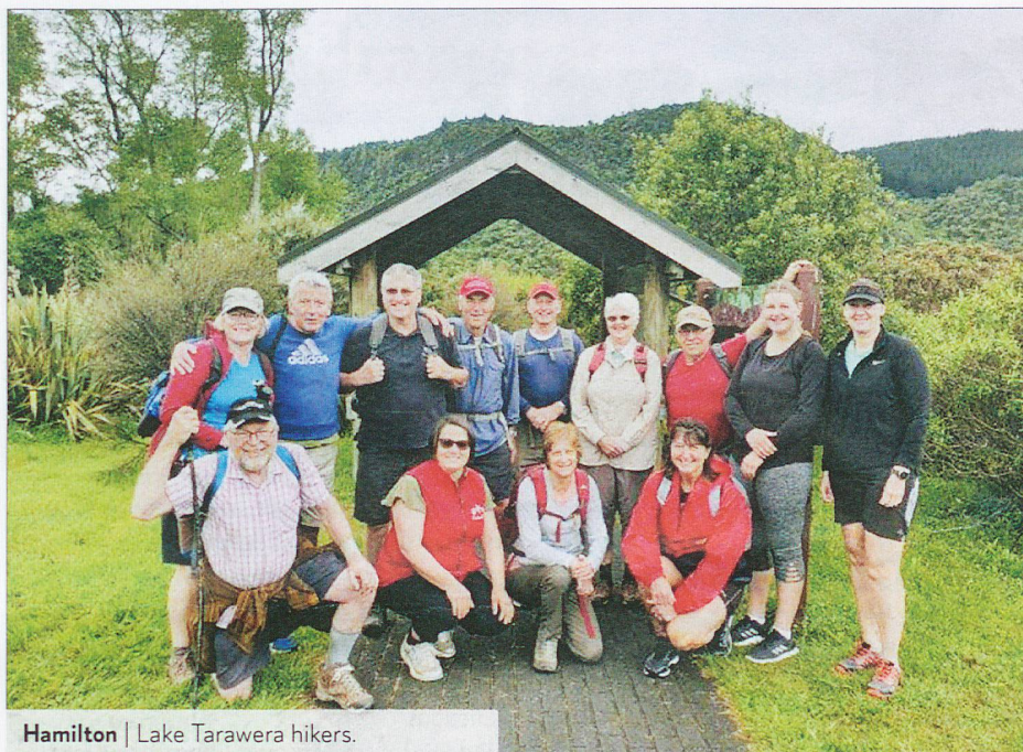
Hamilton | Lake Tarawera hikers.

21: Family Picnic – advance notice. 50 metre medal shooting will be held the previous day. Further details in the February Helvetia.