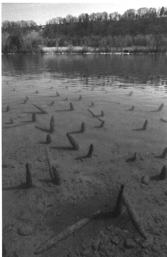
Fig. 2. Horizontal eroded wood preserved on the surface of the soil, Vully-les-Lacs VD-Montbec.

In the case of prehistoric pile dwellings around the Alps, preparation of the nomination dossier mobilized researchers to assess their state of knowledge and contribute to synthetic research. There were associated publications and museum exhibition displays linked to that purpose. Five years after inscription however, there is a concern that the synthetic research undertaken for inscription, while immensely successful, may have been achieved at the cost of continuing field investigations, especially on actively eroding sites.