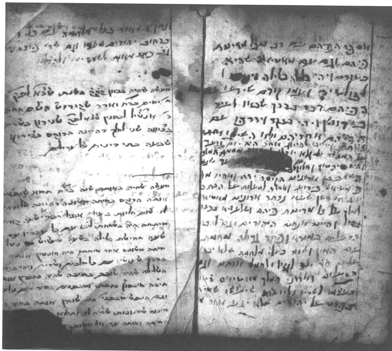
A paragraph from the Prague Hebrew Chronicle Jewish Theological Seminary of America in New York Ms. Mic. 3849, fol. 19v-20r (cf. p. 3 note 6)