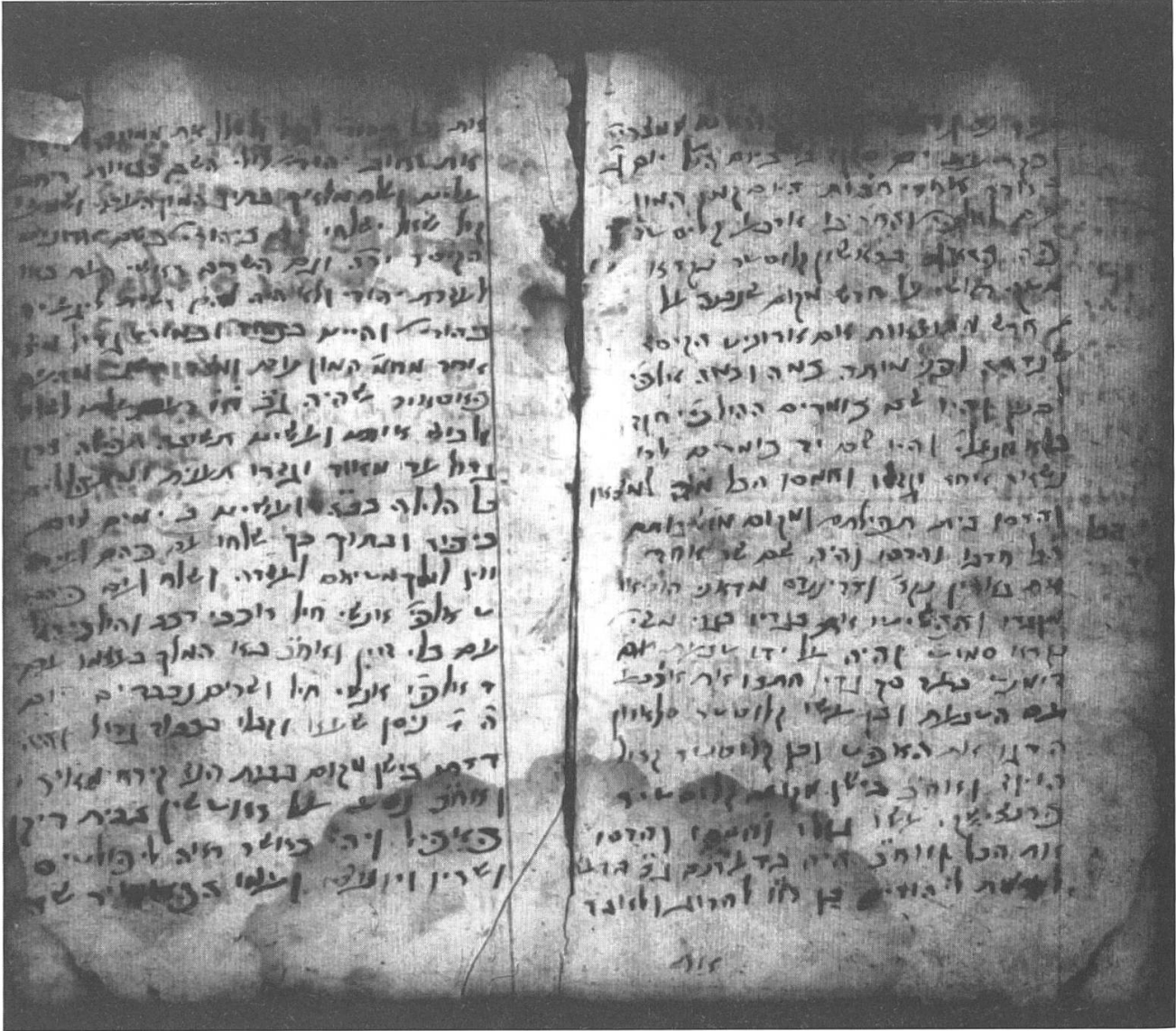
A paragraph from the Prague Hebrew Chronicle Jewish Theological Seminary of America in New York Ms. Mic. 3849, fol. 18v-19r (cf. p. 3 note 6)