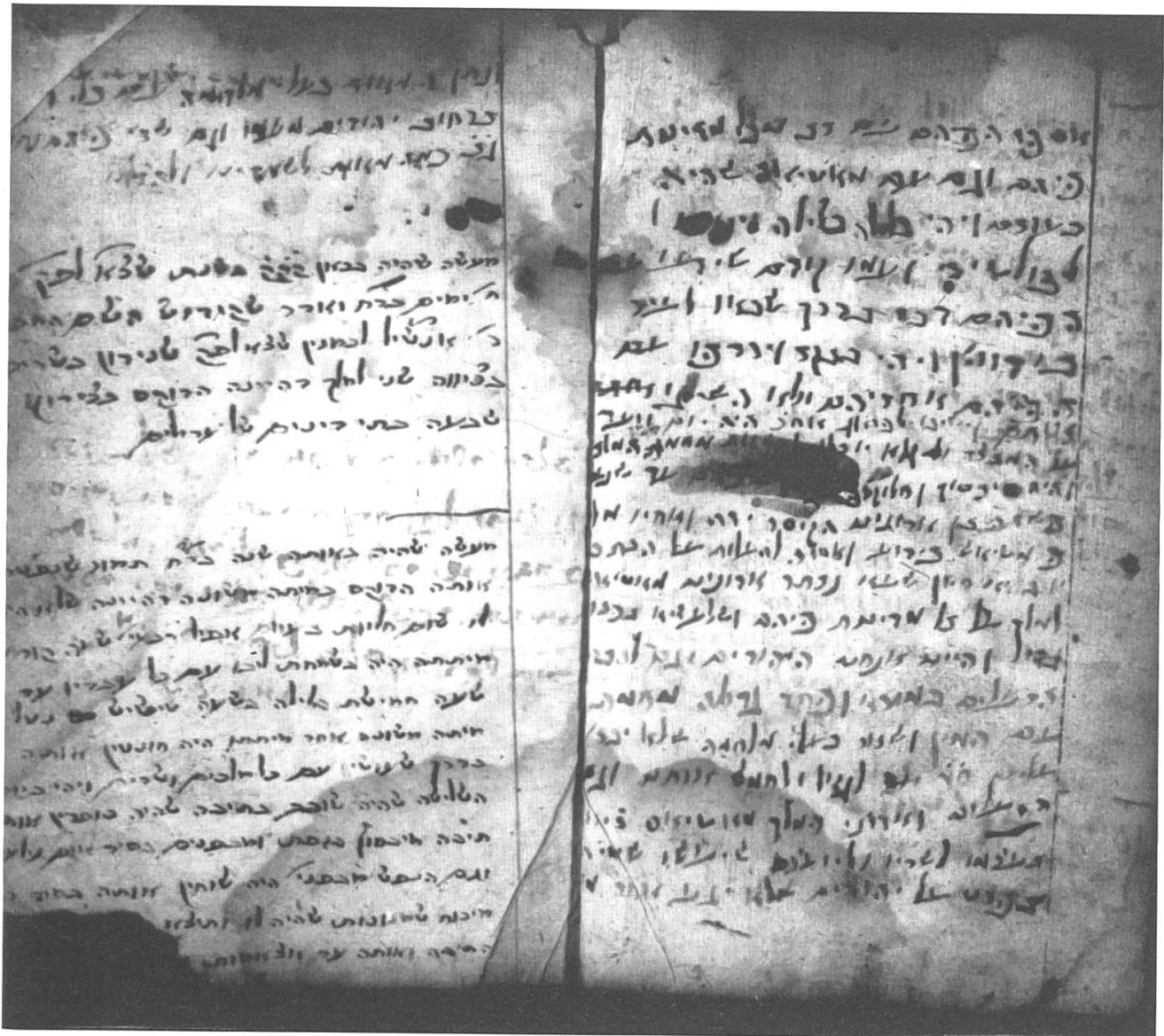
A paragraph from the Prague Hebrew Chronicle Jewish Theological Seminary of America in New York Ms. Mic. 3849, fol. 19v-20r (cf. p. 3 note 6)