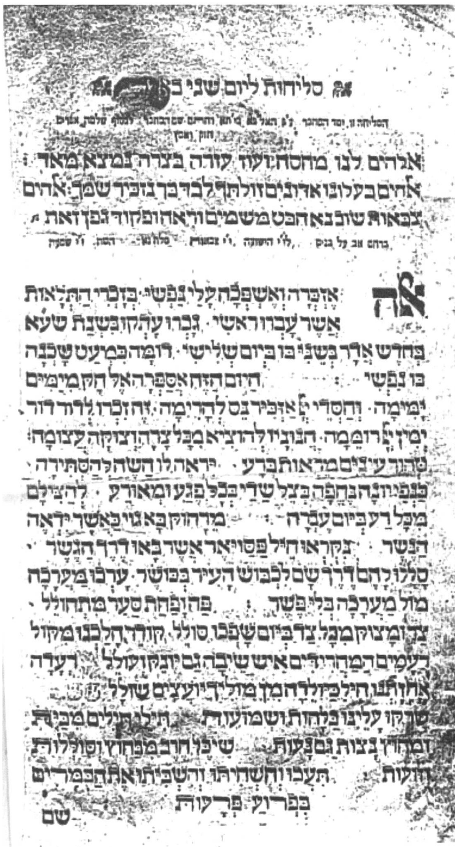
The first page of the first penitential prayer for the second day of Adar 1611, by R. Solomon Ephraim b. Aaron of Łeczyca (cf. p. 13, note 36)