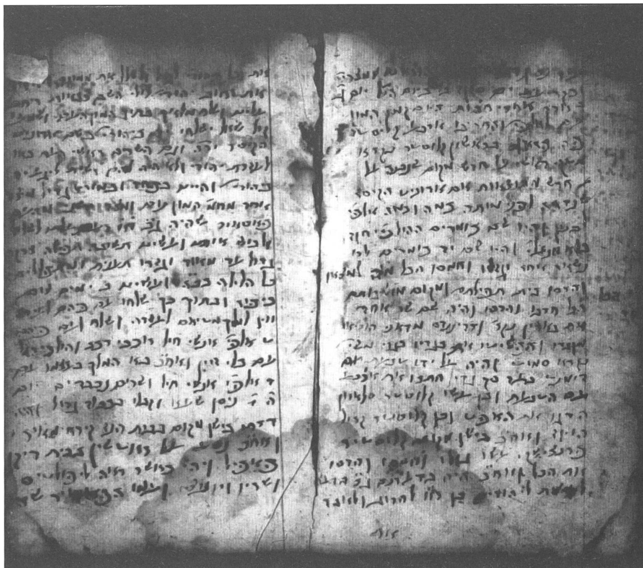
A paragraph from the Prague Hebrew Chronicle Jewish Theological Seminary of America in New York Ms. Mic. 3849, fol. 18v-19r (cf. p. 3 note 6)