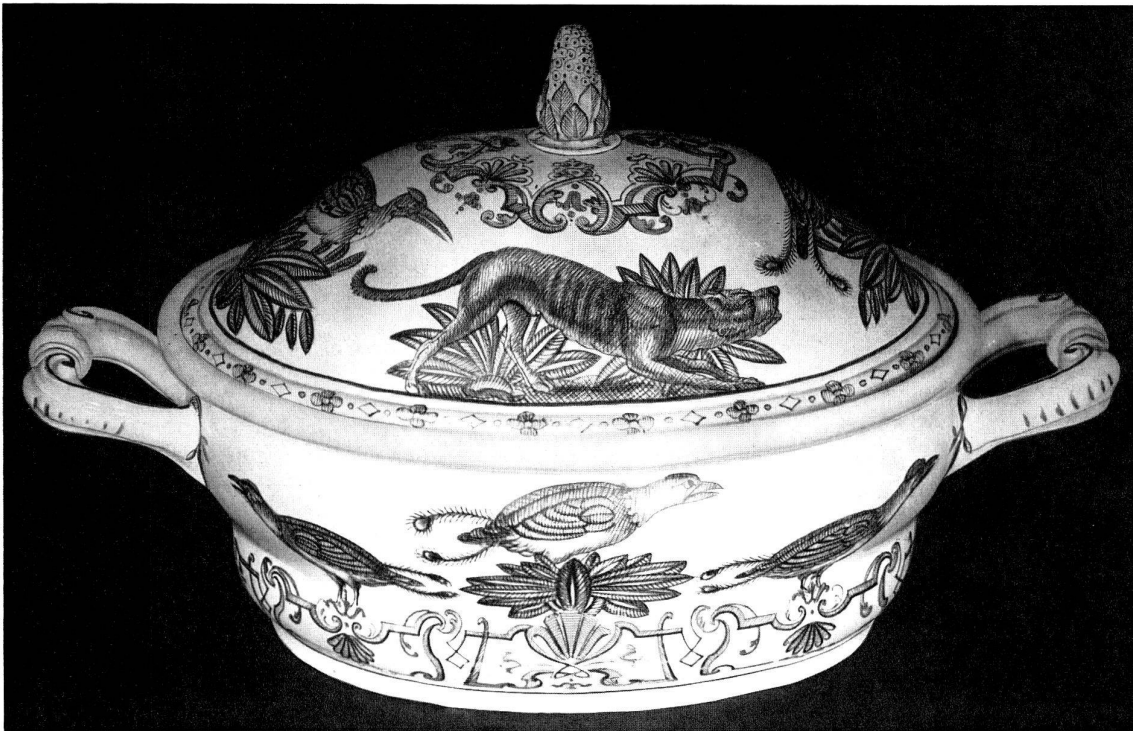
Abb. 20 The «scratch-marked» tureen. Notice how there is shading that is brushed in, rather than «crosshatched». The shadow under the wolf-dog, the leaves etc.