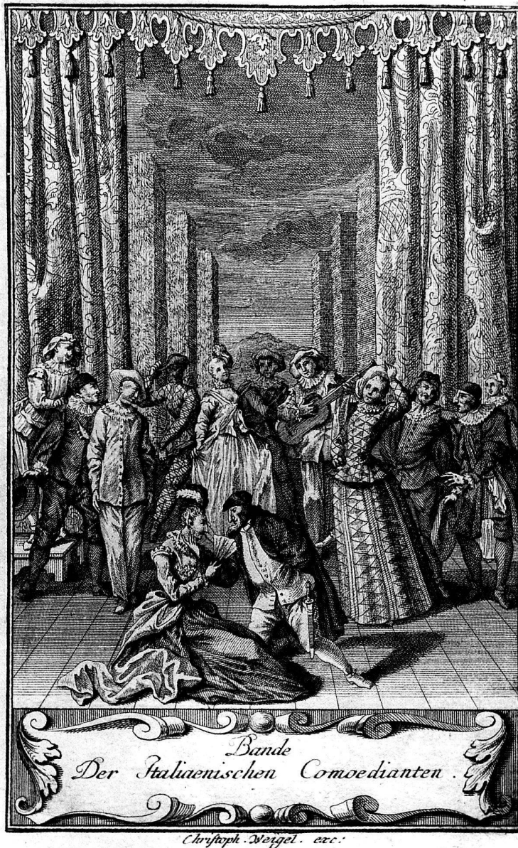
4. TROUPE OF ITALIAN COMEDIANS. Engraving by Christoph Weigel, Nuremberg, c. 1723.