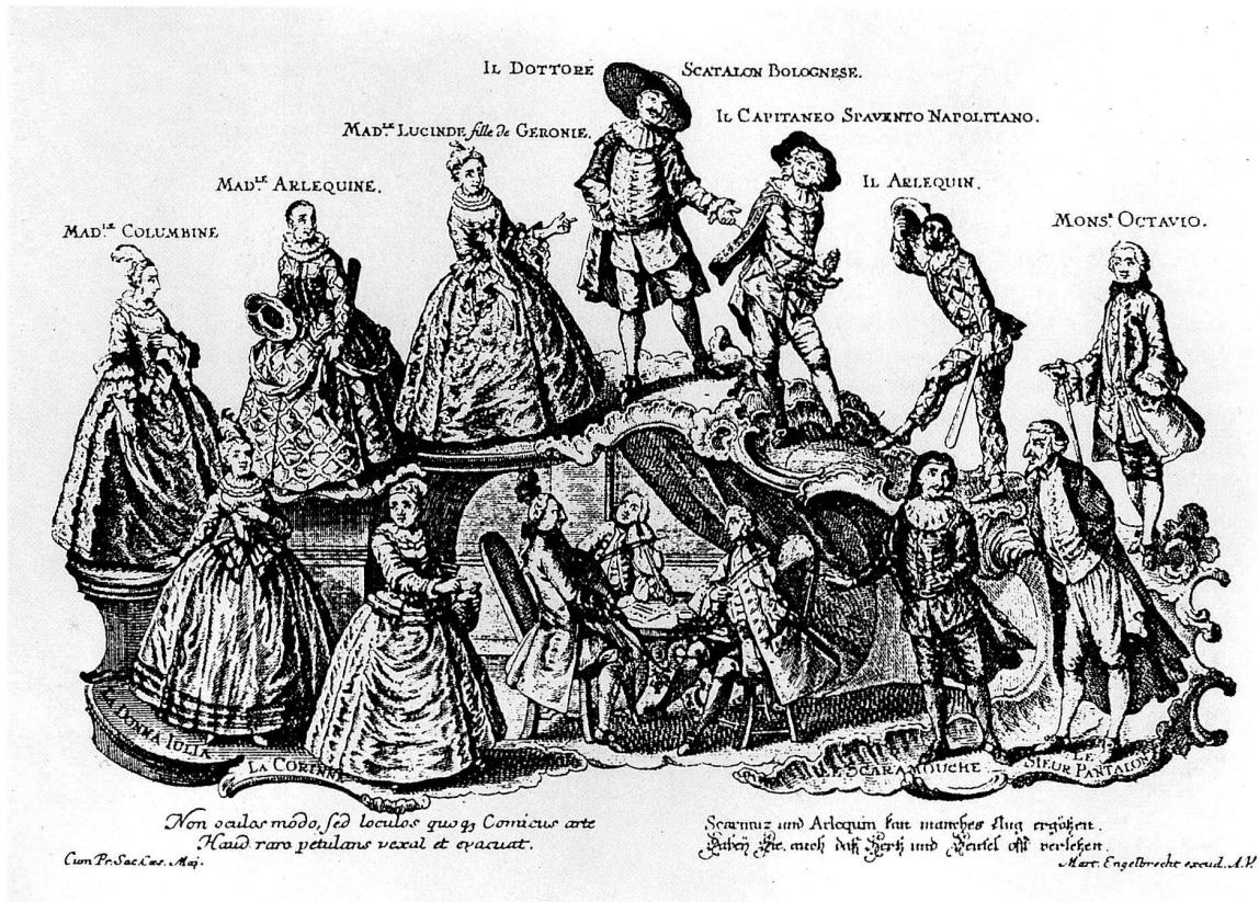
5. GROUP OF ELEVEN NAMED ACTORS of the Théâtre Italien, with moralizing verses in Latin and German. Engraving published by Martin Engelbrecht (1684–1756), Augsburg, 194×297 mm. Mid-18 th century. Sign.: Cum Pr.Sac.Caes.Maj/Mart. Engelbrecht excud.A.V. Deutsches Theatermuseum, Munich.

Three mid-18 th century production lists of Nymphenburg porcelain are recorded 27 , of which the first, a stock-list at Neudeck Castle of 8 August 1755, is too early to be of interest here. The second is the Inventory of Moulds dated 1760 5 , which lists 1 Harlaquin and 1 Harlaquinin , as well as 16 Stuckh Pantomim Figuren (16 pieces pantomime figures). In 1760 Bustelli had completed the modelling of the larger Harlequin and Harlequina, as well as the complete standard-sized set of the sixteen comedy actors, but this list contained no additional information on them.