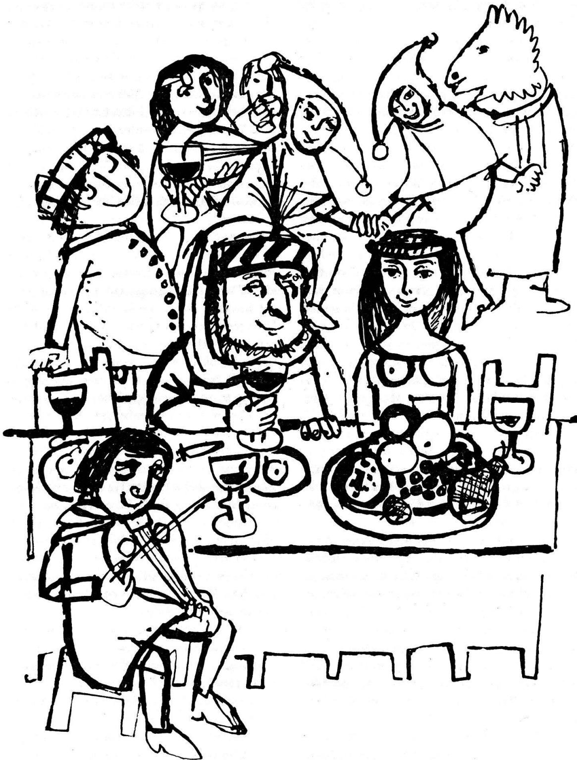
Drawing by Derek Cousins for the Lion & Unicorn Press edition of Chaucer's The Merchant's Tale. The original drawing has a colour background loosely fitting around the figures and the table

£1,600 but in 1947, £2,300. At this same June 1961 auction eighteen typed letters of G. B. Shaw fetched £300. Particularly the