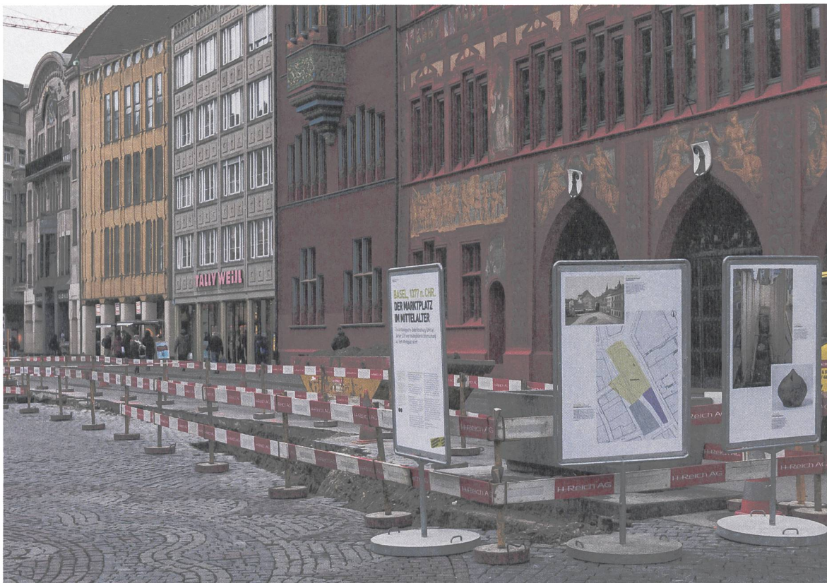
Fig. 2: Archaeology in front of Basel City Hall.

In order to increase its visibility both in the public sphere and with respect to other cultural institutions, the Archäologische Bodenforschung partnered with New Identity Ltd. to create a modern corporate design. In organisational terms, the agency gave more weight to public relations by creating an «outreach» department at the expense of other activities. The department currently has about 14% of the agency's human and financial resources at its disposal. The corporate design is now consistently applied in all public relations activities and publications. It is based on barrier tapes, such as those used by the fire brigade or police at the scene of an incident. The coloured tapes indicate that the detailed documentation of a historical «crime scene» is in progress. In 2010, the design and content of the annual report – previously large an anthology of