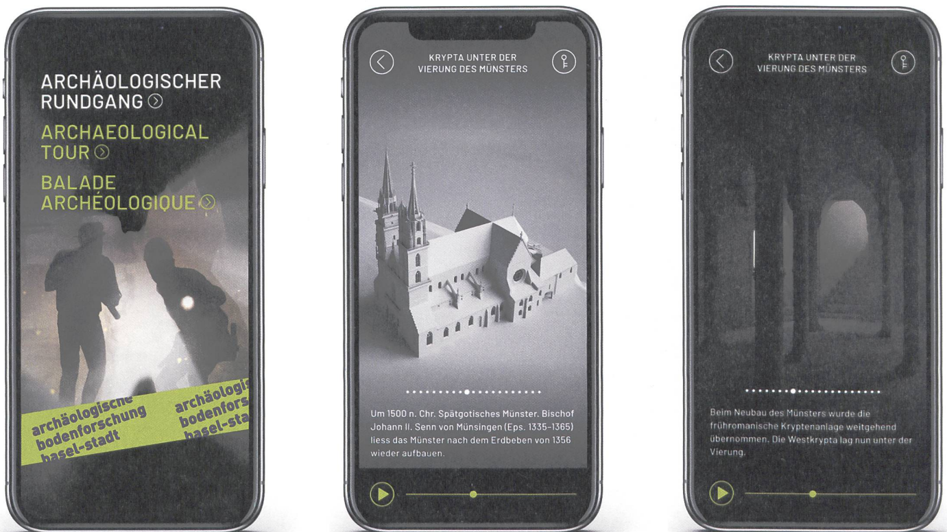
Fig. 5: Archaeological Tour – 3000 Years of Cathedral Hill History app in three languages along with informative images.

Society's demands on archaeology have changed over time. It is no longer enough to invoke legal provisions to safeguard cultural heritage or to target outreach activities to a specialist public. The general public needs to be reached as well. At the same time, attention must be paid to attractive, modern outreach based on science. In this way, policymakers will ultimately also be made more aware of the importance of archaeological sites as sources of historiography. ■