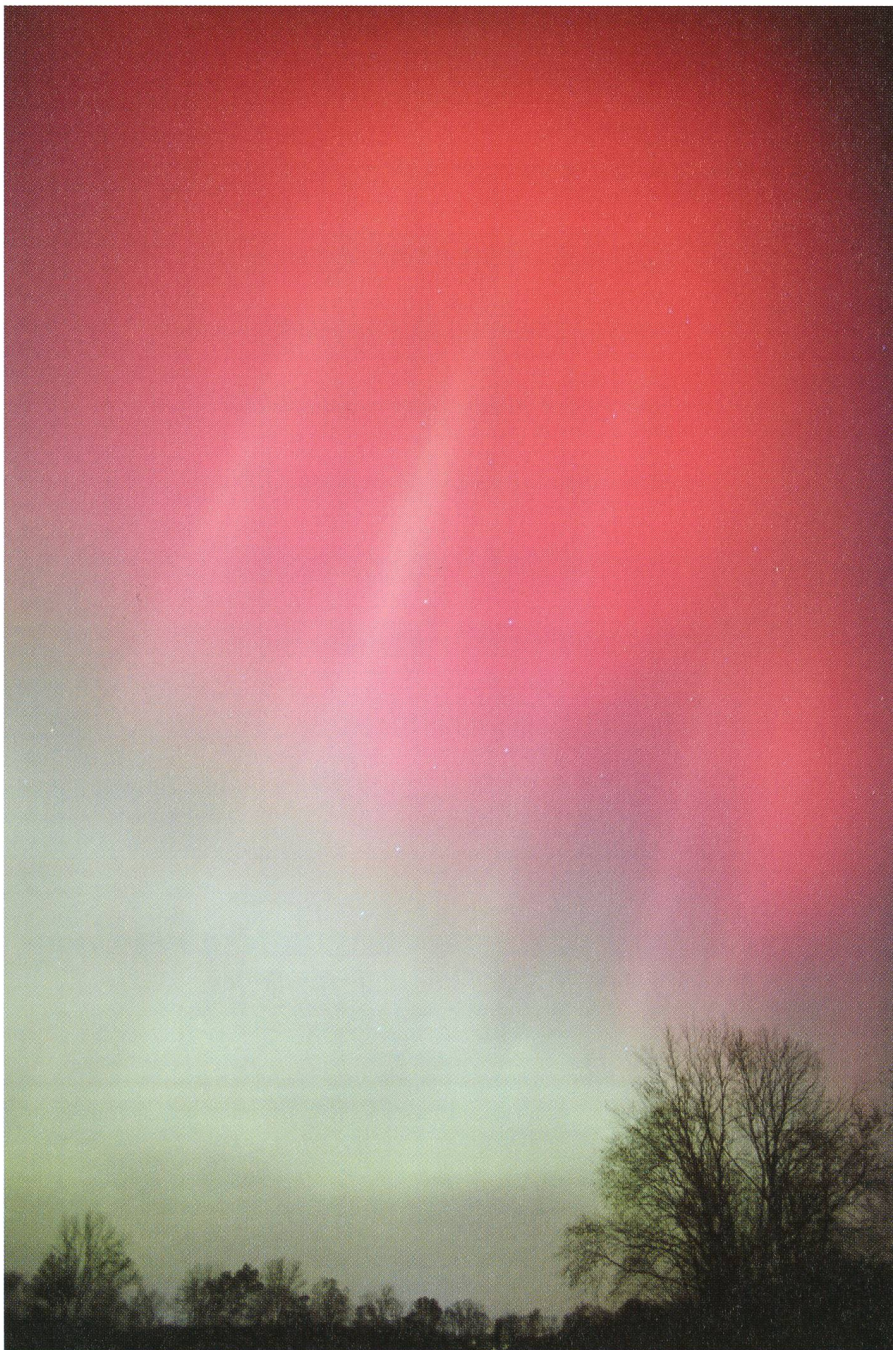
Fig. 1: 0906 UTC; Film: Fuji NPZ (ISO 800); Canon F1, Canon 24/1.4L @ f/1.4, 20 seconds.

0832: Arc intensified very quickly; very intense green, 5° thick from 7-12° altitude, 330-030° azimuth.