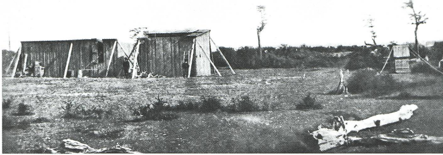
Fig. 6. The observing huts of the Brazilian expedition (from Annales de l'Observatoire impérial de Rio de Janeiro , tome 3, 1887).

tions. In 1889, he presented a more or less final result, 8.842 \pm 0.0118 arc seconds, based on 1475 plates of the 1882 transit (HARKNESS 1891). Although it had been planned to publish the details of the observations, this was never done due to lack of funds – even of the projected 4-volume report of the 1874 U.S. observations, only one volume was published, and the single copy of the proofs of a second volume can nowadays be downloaded from ADS.