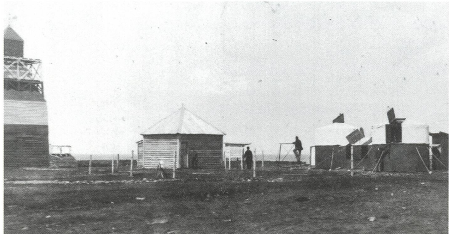
Fig. 7. Photograph of the German station in Punta Arenas. Left, wooden lighthouse of Punta Arenas, center, «tea house» and meteorological station, right, two observing domes made from iron and canvas.

In the morning of October 11, the Ramses anchored on the roads of Montevideo, and the passengers met their companions who had travelled with the Rio . In the afternoon, the Ramses con-