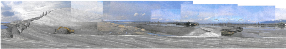
topographical section of intervention