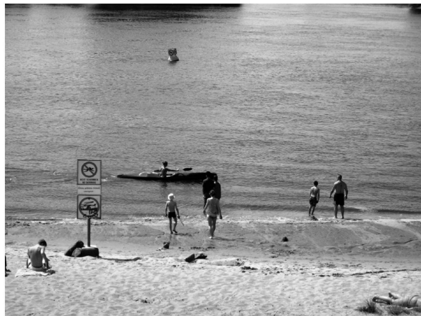
figure 2: Mapping the "Dike Park". figure 3/4: Existing Activities in the "Dike Park".