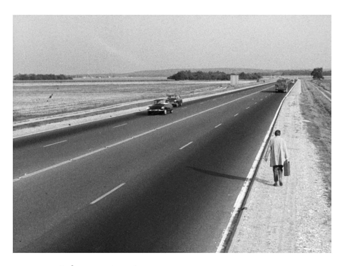
Jacques Tati, Trafic, 1971, Film Still.