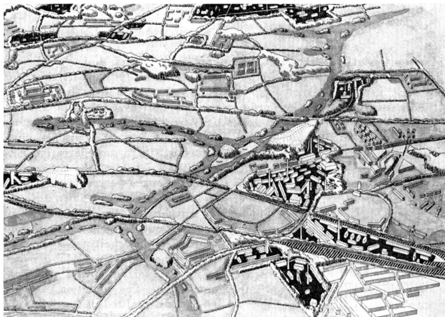
Geplante Industrielandschaft - Paysage industriel aménagé - Planned industrial landscape.