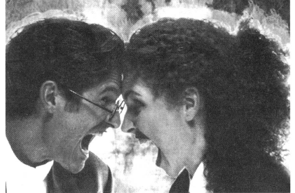
Anscheinend haben gleichgeschlechtliche Paare keine Kommunikationsprobleme...

Ganz natürliche Erklärungen für eigentlich unerklärliche Schwächen