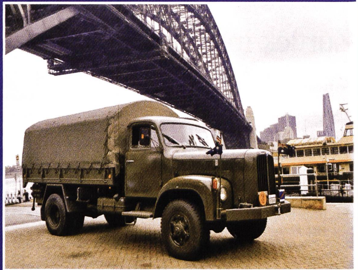
📍 Taking part in the 2021 Harbour Bridge run.