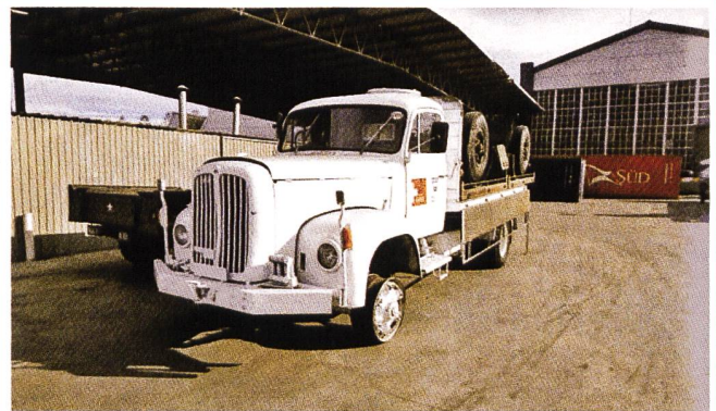
📍 My 1971 Saurer 2DM 4x4 after arriving and being unloaded from the container at the Flinders Adelaide Container Terminal.

My first thought was about how I was going to tell the Missus, but it was too late – it had already been loaded into a shipping container. It turned out that my mate had bought the one he wanted, which was in the original Army green configuration, and was then offered two white ones