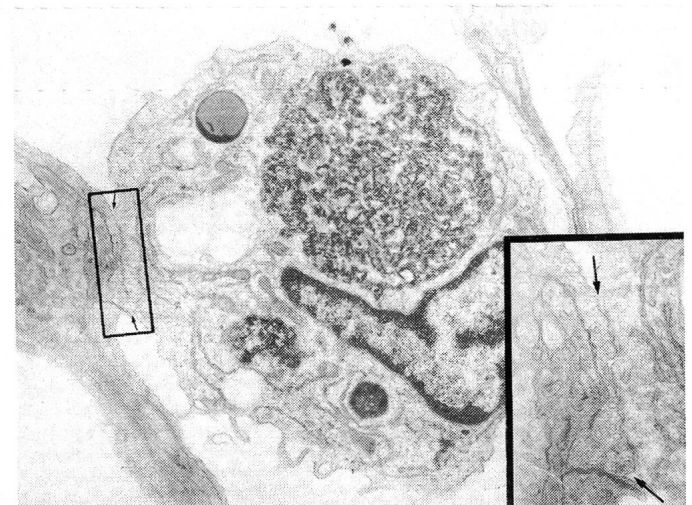
Fig. 2: Pulmonary intravascular macrophage. X15000. Insert: Intercellular junction of a pulmonary intravascular macrophage.