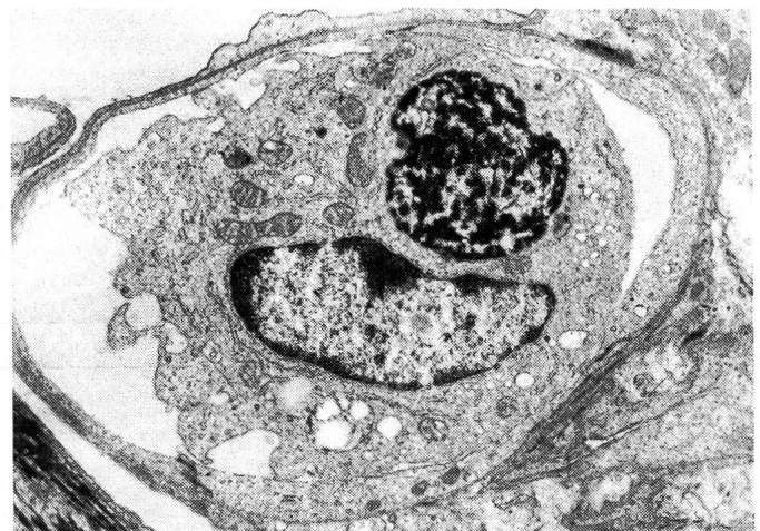
Fig. 1: Pulmonary intravascular macrophage with secondary lysosomes. X 15 000.

tosis on inoculation of bacteria (2), endotoxins (8) and viruses (7); according to some authors (2, 7-9), these cells play a major role in lung clearance. According to our own experience, most PIMs show