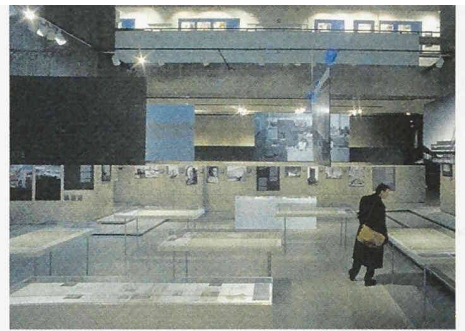
1 a and b «Saving Corporate Modernism» at Yale University, 2001