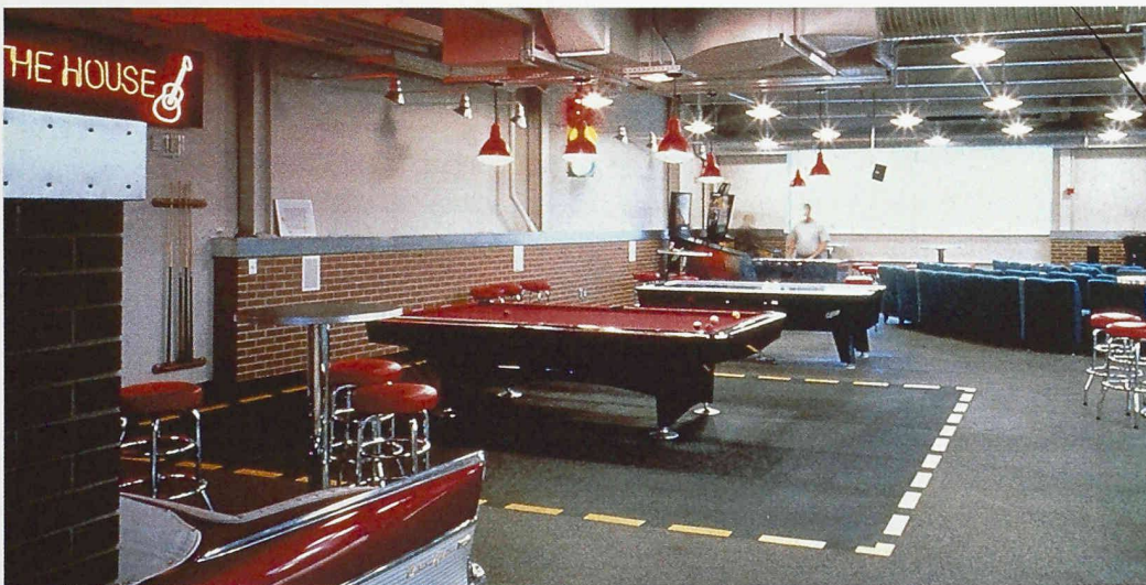
2 «Chill Out Room» of Stanmyre Noel Architects, 2000

As I sit on the train writing this article on my laptop, taking over the seat next to me for my desk, I ignore the view so that I can gaze endlessly into this screen and then send the article via email to Switzerland. Glamorous? Is it that our jobs require that we must be more mobile and simultaneously complete our work? Or is it because our equipment allows us to be mobile so that we do travel for work? In either case designers are seeking ways to improve the physical environment so that we don't get repetitive motion syndromes, can interact with co-workers, be productive and creative, and maybe take a moment to gaze out the window.